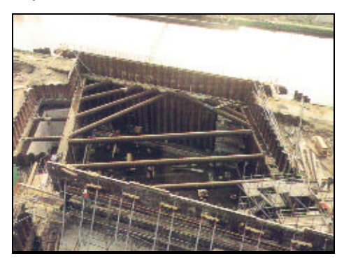
HBW specializes in construction in water-saturated soil.

"Creating an optimized design for a four wall building pit used to take a week, Using Bouput++ such an optimized design now takes less than a day!"