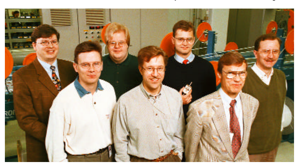
This team of experts from Nextrom and Design Power jointly created a visual sales automation tool that allow Nextrom sales-engineers to leave their competition behind.